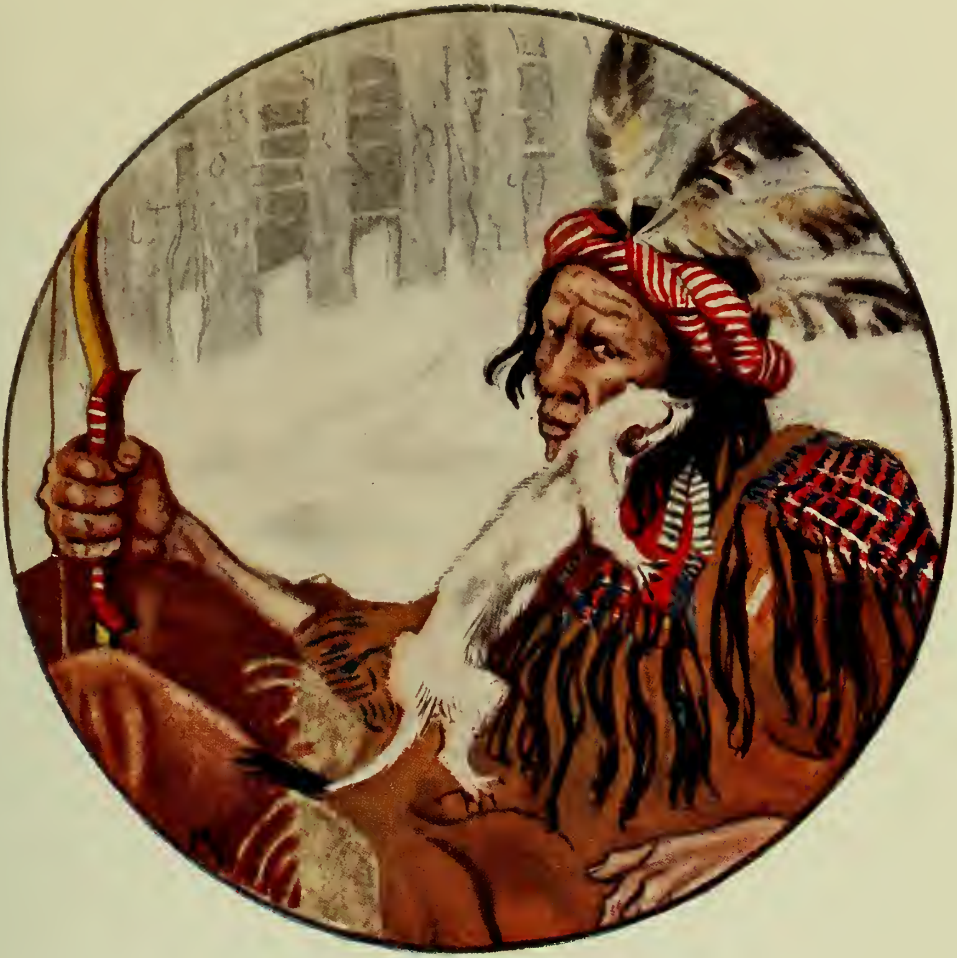
THE COAT OF ERMINE WAS REPLACED BY A SLEEK AND SHINING WHITE COAT, AS SPOTLESS AS THE NEW SNOW IN WINTER